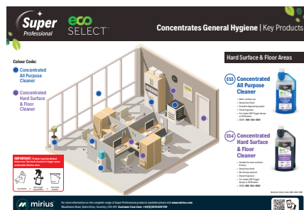
General Hygiene Wallchart Order Code: 200-400-1061

A selection of printed Wallcharts and a Multi-lingual COSHH poster are also available on request, please contact our Sales Department orders@mirius.com to find out more.