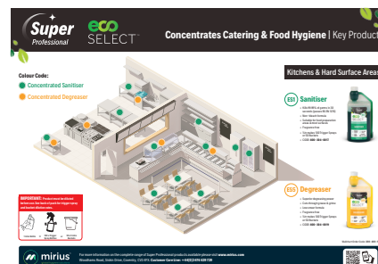
Catering & Food Hygiene Wallchart Order Code: 200-400-1062