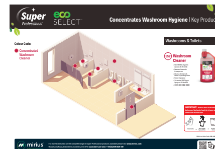
Washroom Hygiene Wallchart Order Code: 200-400-1063